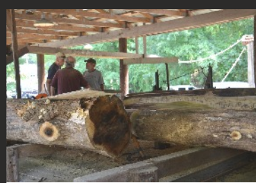
ANTIQUE SAW MILL