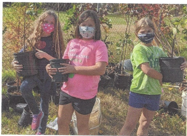
Girl Scout Troop #1778

The grant is for the removal of invasive trees and plants as well as the planting of native trees and plants.