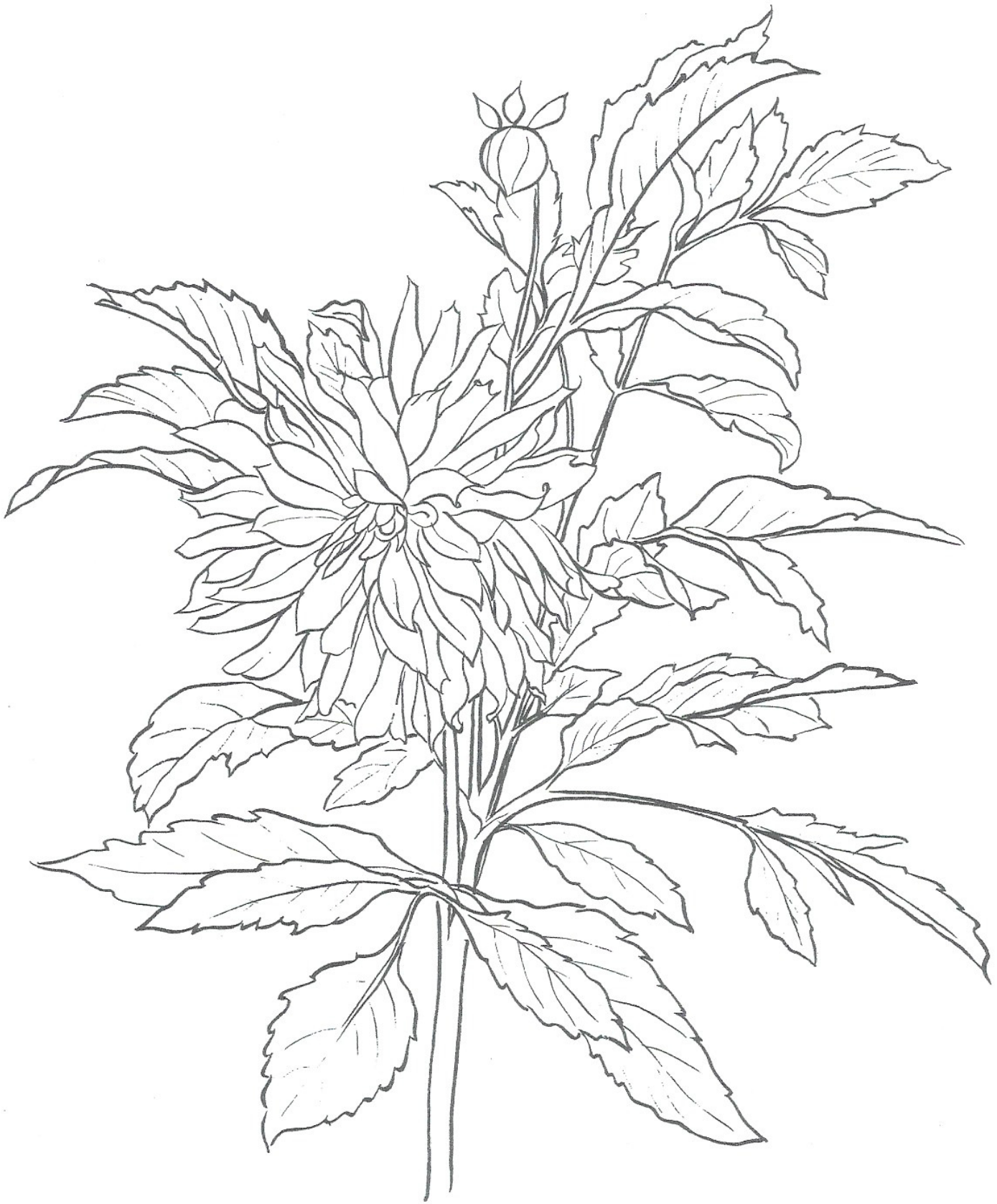
10. DAHLIA. ( Dahlia pinnata ). White, yellow, pink, red, lilac, purple, or orange-brown. Tender perennial. Summer and fall.