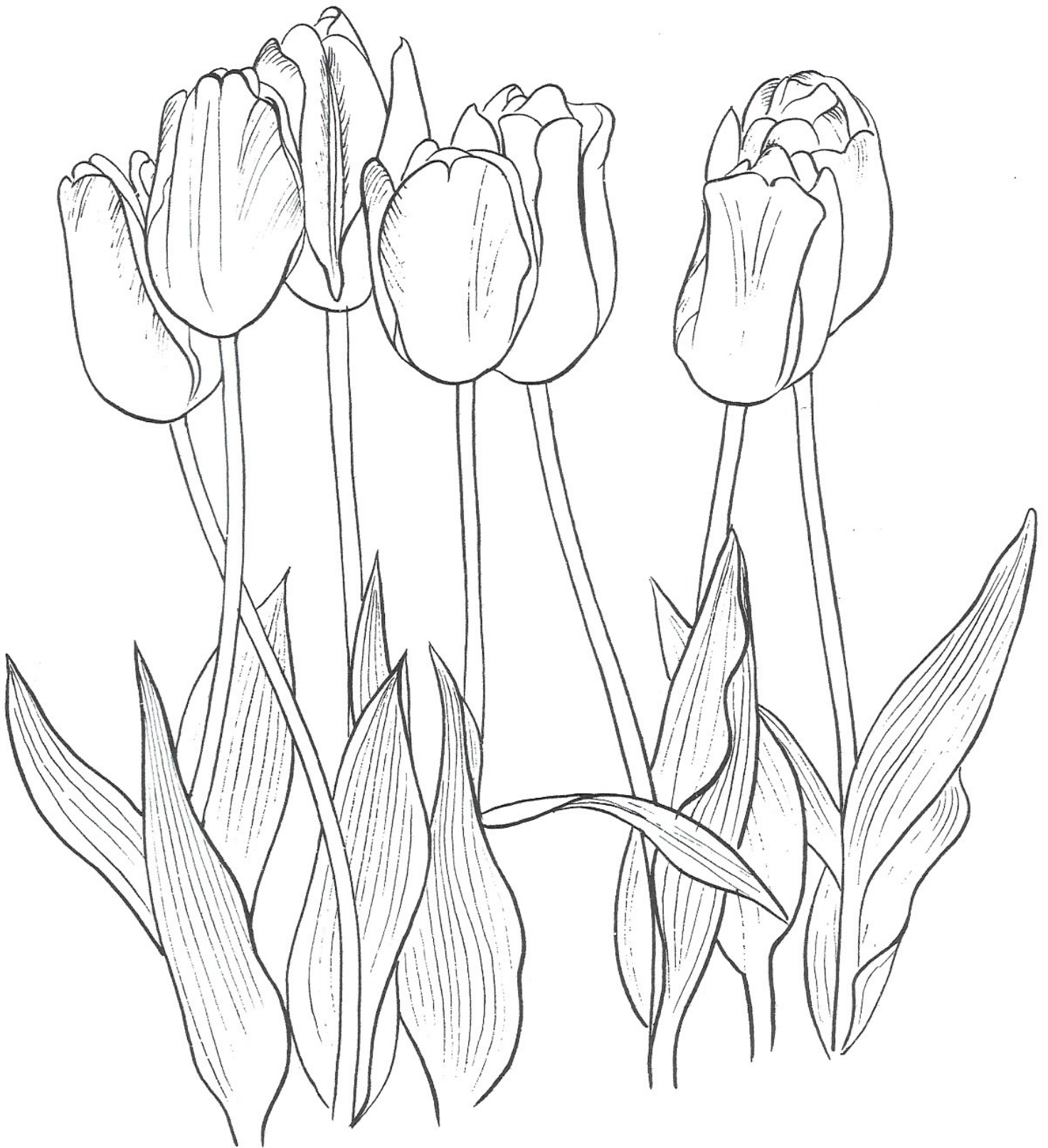
39. TULIP. ( Tulipa hybrids). The color range is extremely wide, from clear white, yellow, orange, or reds of the early varieties to rich purple, brown, red, pink of the late varieties. There are also stripings, featherings, and variegated petals. Spring-flowering bulb.