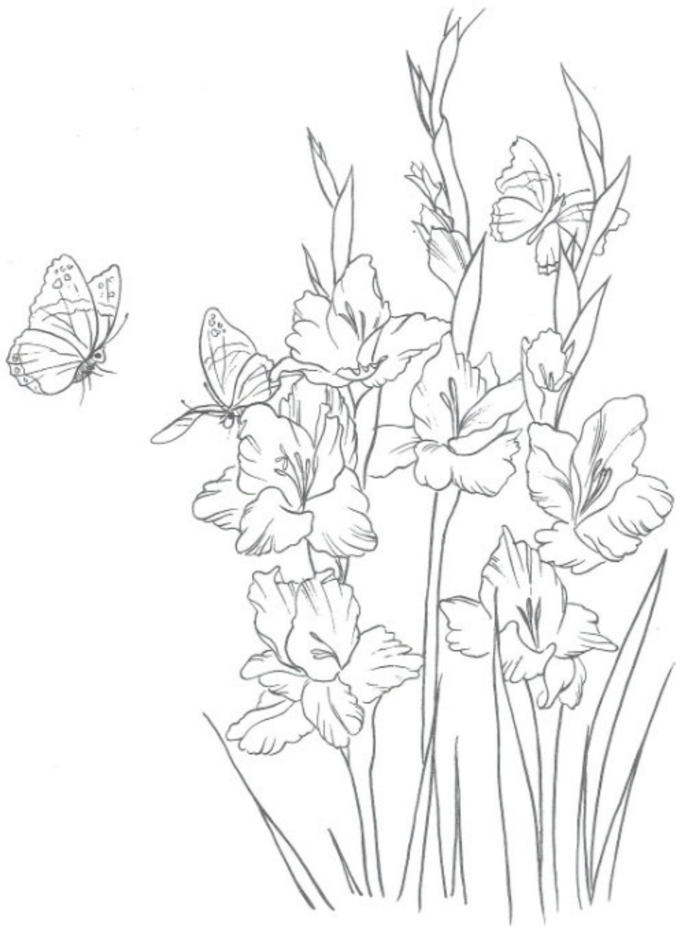
16. GLADIOLUS. ( Gladiolus hybrids ). White, yellow, pink, red, lilac, or purple. Tender perennial. Summer.